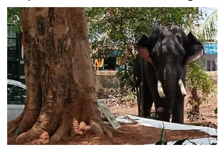
figure swaying. It was an Elephas maximus indicus (Elephant). I

Pattupurakkal at Kakkanad. Hmm...somethings did not change like the buses on the road...As we moved ahead we noticed a different species hiding among a living species which the homo sapiens call it a TREE. It was unbelievable to see Ficus benghalensis (Banyan tree) which possibly one see in an AI generated images. Behind this Banyan tree we could not imagine a giant like